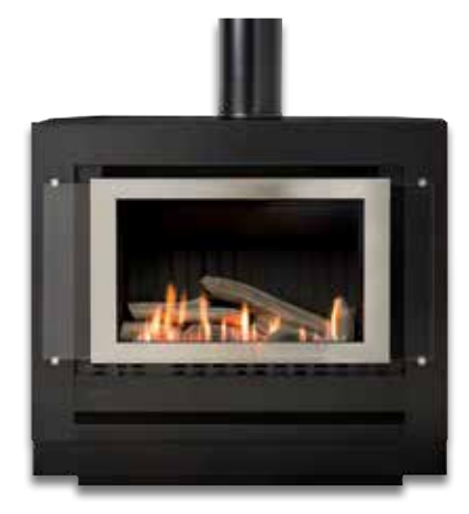
Stainless Steel on Black Freestanding Floor