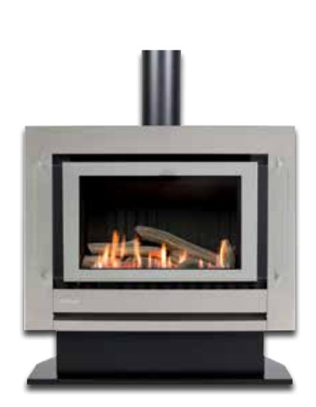
Stainless Steel Freestanding Plinth