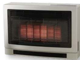
Ultima II in Gunmetal