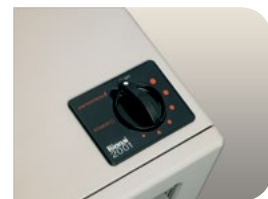
2001 Control Panel