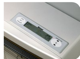
Ultima II Control Panel