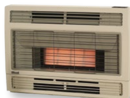
Spectrum in Beige