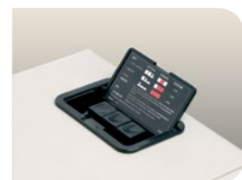
Spectrum Control Panel