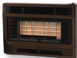
2001 in Brown