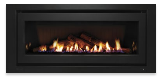
Black on Black Frame