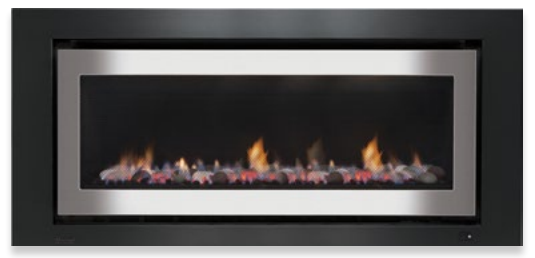
Stainless Steel on Black Frame